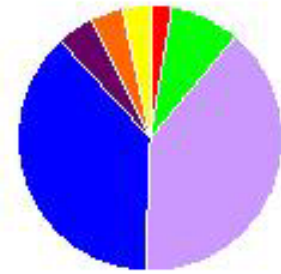
How the money was spent

We believe in strengthening local bodies and we started strengthening SHGs and did not focus on SHG formation. SHGs were identified in the first phase and federated under the name Seva Magalir Sangamam. More than 204 SHGs joined the federation and it is growing strong. This federation is first of its kind in Karaikal. Duplication was completely avoided as we selected only Government formed SHGs in Karaikal. In some villages we managed to link Panchyat with SHGs and most of our work was routed through them.